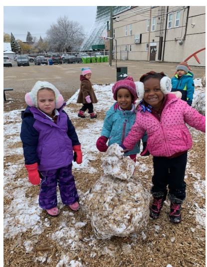
JK's enjoying the first snowfall of the season.

All parents, grandparents and family members are always encouraged to volunteer and participate in many of our school events. We love to see you coming out to our monthly masses (next mass is on Nov 29th at 10:00am).