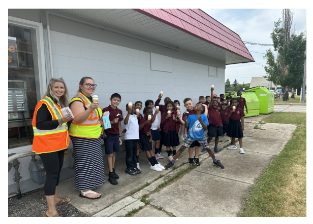
Dairy Queen for our "Mini Field Trip" on Tuesday, June 27th.