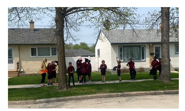
Gr. 4 cleaning the neighbourhood