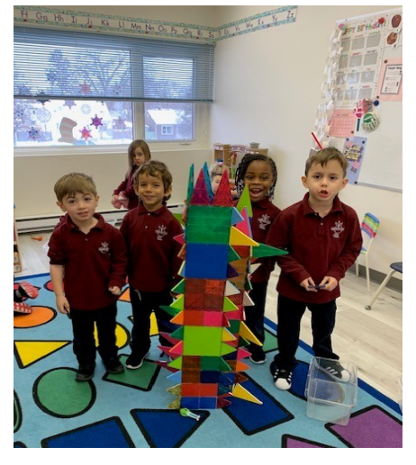
Look what we built!