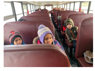
JKs first bus ride!