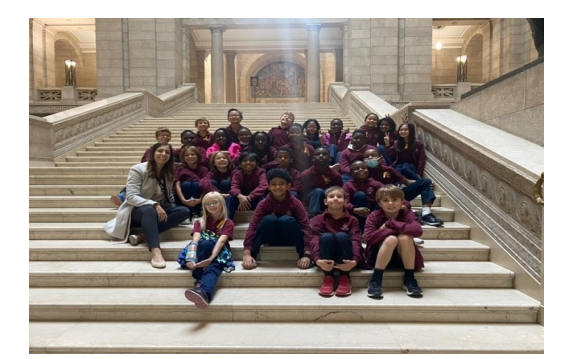
Grade 4 at the Legislative Building

(basically a scepter) is made of bronze and covered in a thin layer of gold? And that there are two of them? The original Mace was the only object that could be salvaged from a burning Legislative Building. Now it is retired and on display. It is made of wood and painted gold. The Mace we have right now is made of bronze and is coated with a thin layer of gold and has semi-precious jewels embedded in it.