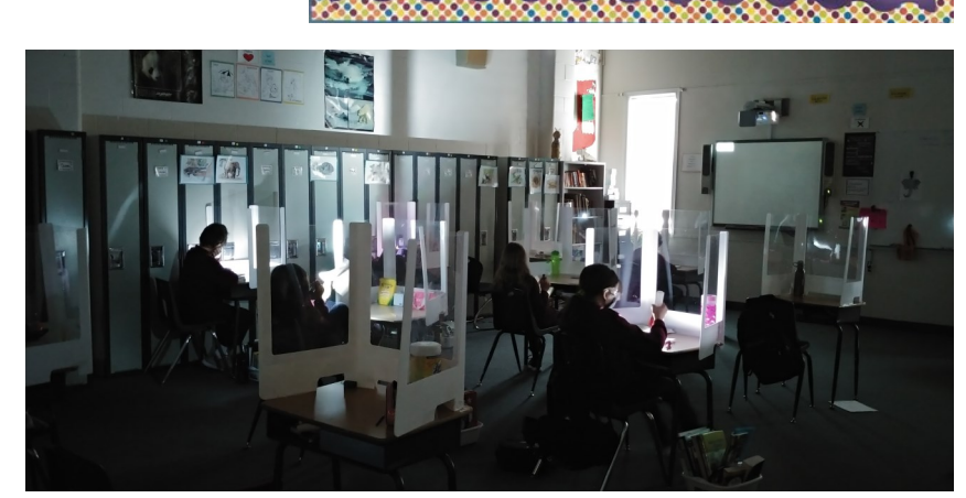
Reading by flashlight