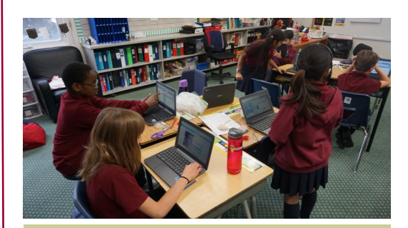
Students using our new Chrome Books