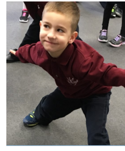
Striking a pose while playing the drum game