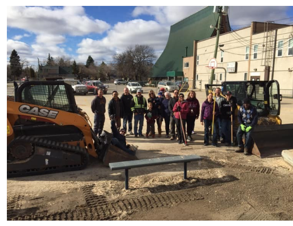
Thank you to all our volunteers!