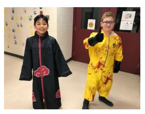
On October 18th, Christ the King School held it's Halloween Dance. Over 200 students from the Independent Schools in Winnipeg were in attendance. Thank you to parent volunteers, staff supervisors and the Student Council members for helping make our dance a success! Profits were $892.