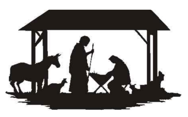
INSERVICE DAY CHILD SERVICE

Our school is once again participating in the Knights of Columbus "Keep Christ in Christmas" Coloring Contest. All submissions need to be handed in to your classroom teacher by December 20<sup>th</sup>